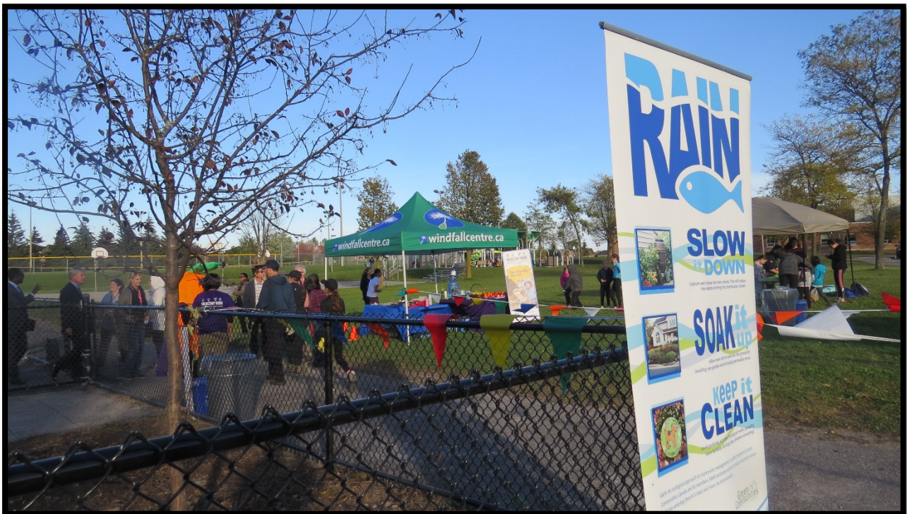
The Windfall Ecology Tent with workers milling around.

The Aurora Lions Club did their Governor's Service Project a little early. We fed the volunteer workers at a De-Pave and Restore event organized by Windfall Ecology Centre. The pavement in the Kindergarten play yard was removed and replaced with mulch and trees and bushes. Flowers will be planted in the spring.