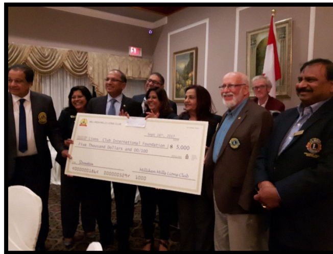
Markham Milliken Mills Lions presenting a cheque for LCIF