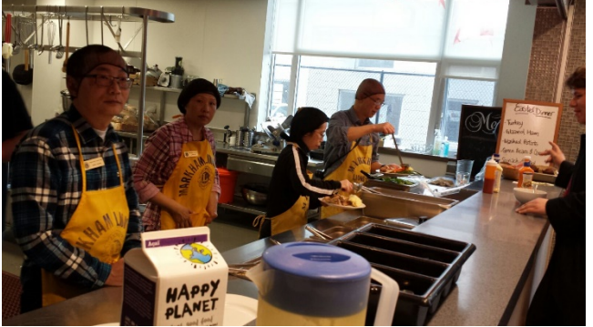
Our Lion "kitchen" crew all geared up to serving a delicious and heart-warming Easter Dinner..."Happy Planet" it is!