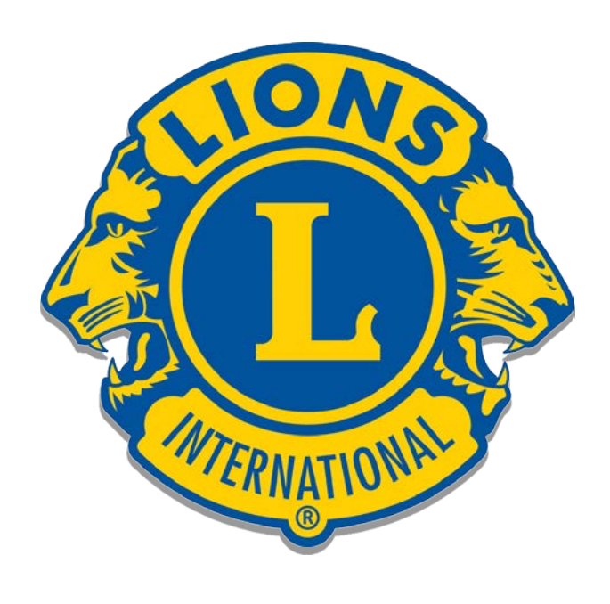
February 27, 2017