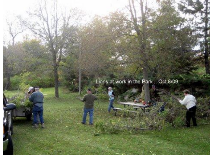
Lions at work in the Park . Oct.8/09