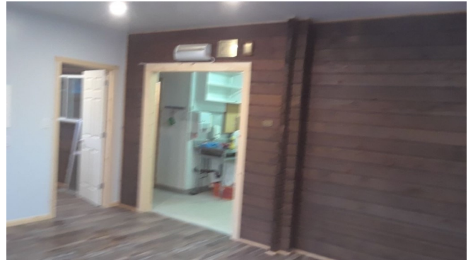
View into Kitchen