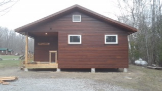
View Driving into Camp