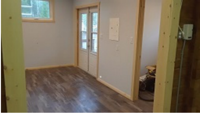
View from Kitchen