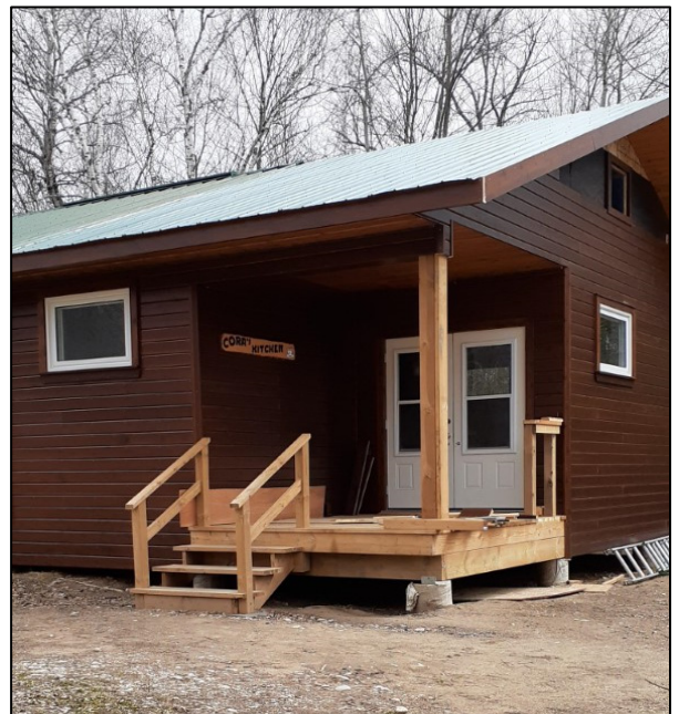
Entrance to Addition

Lion/Lioness Elaine, LCCKF Chairperson April 14/20