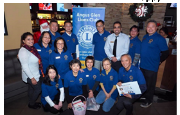
The Team and the owners of the restaurant