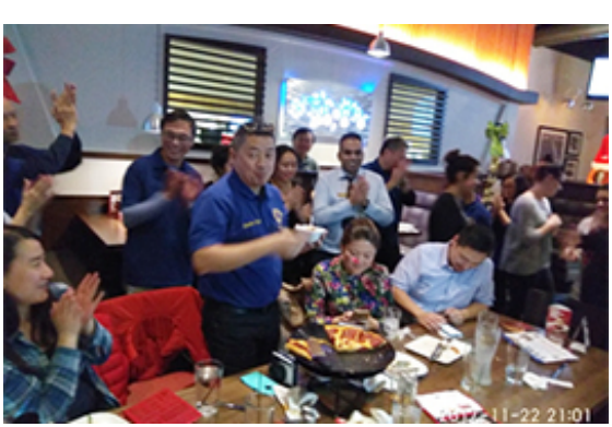
Who's that birthday boy? Lion Charles it was!