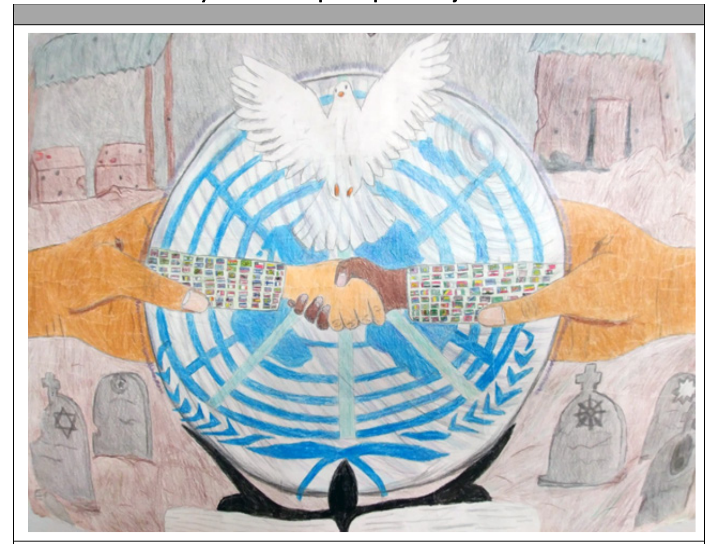
2017-18 A16 Peace Poster Winners

Congratulations to the District A16 Peace Poster Winners Thank you to all the participants. A job well done.