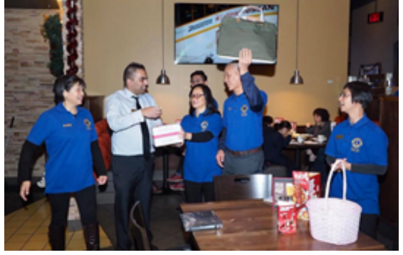
Luck draw at the event