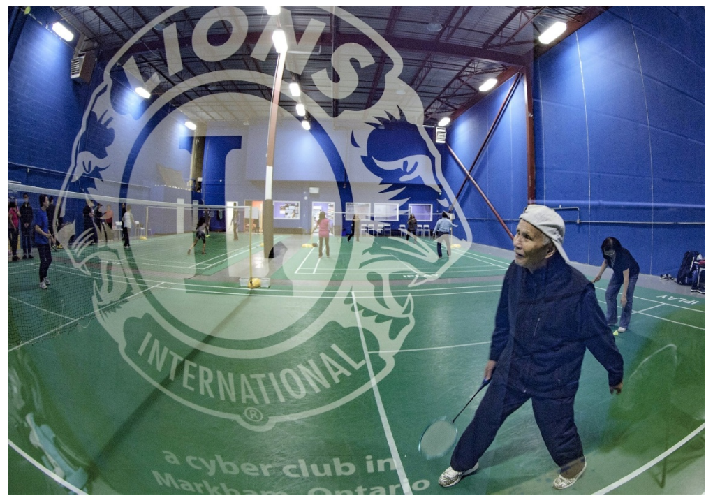
Participants enjoying the game on the day!