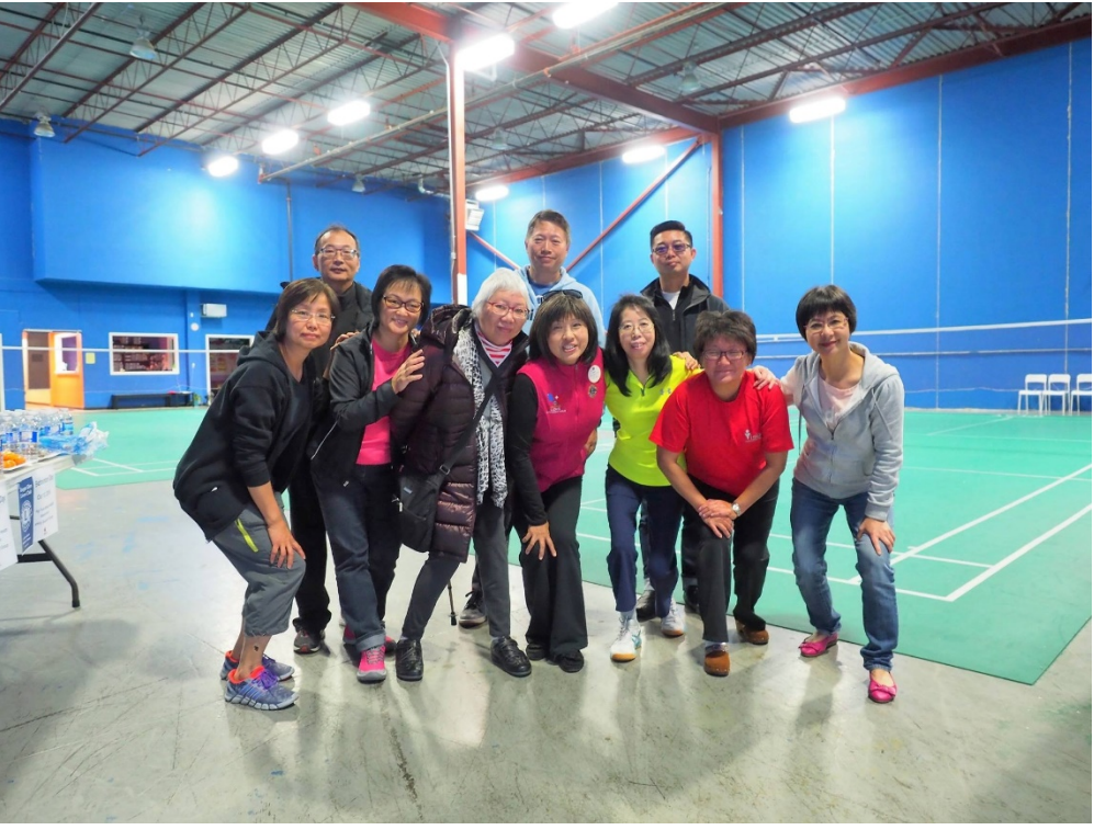
Angus Glen Lions at the Badminton Day